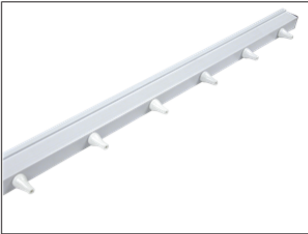
Figure 1. EMIT Non-Air Assisted Ion Bar