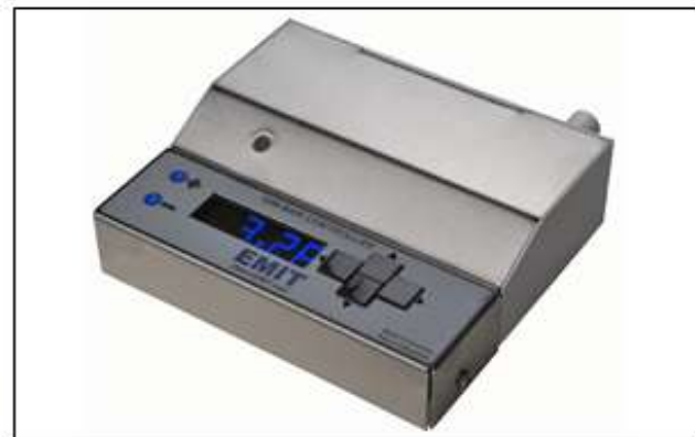
Figure 6. EMIT 50855 Controller with Digital Adjustment