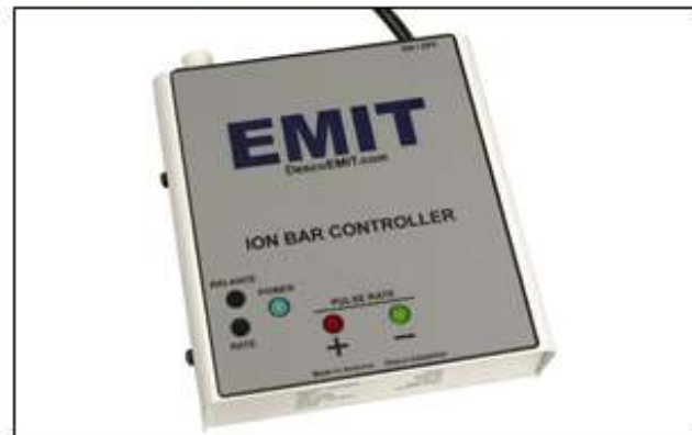
Figure 4. EMIT 50940 Controller with Recessed Potentiometer Adjustment